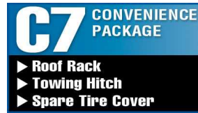
Roof Rack, Towing Hitch and Wire Harness, Spare Tire Cover $1,167 Installed MSRP*