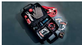
Emergency Assistance Kit $70 Installed MSRP*