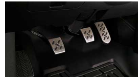
Sport Pedals $85 Installed MSRP*