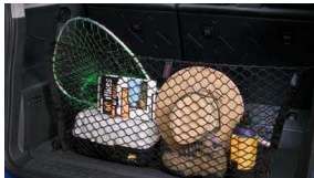
Cargo Net $49 Installed MSRP*