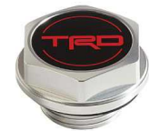
TRD Oil Cap $45 Parts Only MSRP**