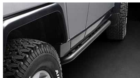
Rock Rails $575 Installed MSRP*