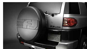
Spare Tire Cover $169 Installed MSRP*