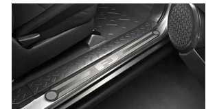
Billet Door Sills $149 Installed MSRP*