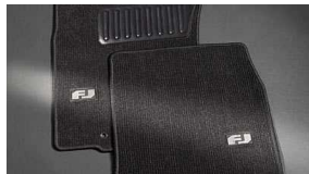
Carpet Floor Mats & Cargo Mat $199 Installed MSRP*