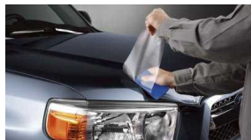
Paint Protection Film $395 Installed MSRP*