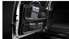
Rear Door Storage Net $89 Installed MSRP*