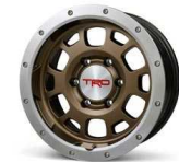
TRD 16" Off-road Beadlock Wheel $219 Parts Only MSRP**