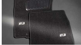
Carpet Floor Mats (4-piece set) $119 Parts Only MSRP**