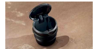
Ashtray Kit $17 Parts Only MSRP**