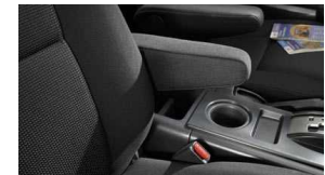
Armrest $125 Installed MSRP*