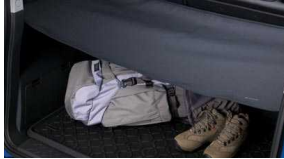
Cargo Cover $90 Installed MSRP*