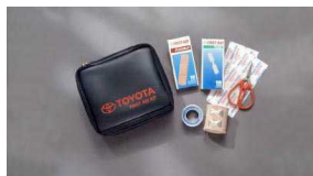
First Aid Kit $29 Installed MSRP*