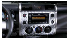
Molded Dash Applique $350 Installed MSRP*