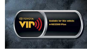
VIP Security RS3200 Plus System $479 Installed MSRP*