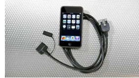
iPod Interface $299 Installed MSRP*