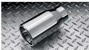
Exhaust Tip $75 Installed MSRP*