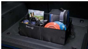
Cargo Tote $40 Parts Only MSRP**