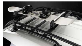
Ski/Snowboard Attachment w/ Adaptor $224 Parts Only MSRP**