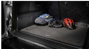
Carpet Cargo Mat $69 Parts Only MSRP**