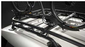
Bike Rack Attachment - w/ Adaptor $274 Parts Only MSRP**