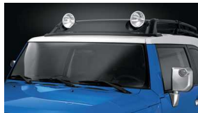
Off-Road Lights w/ Air Dam $799 Installed MSRP*