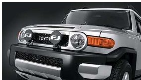
Auxiliary Driving Lights - Bumper $475 Installed MSRP*