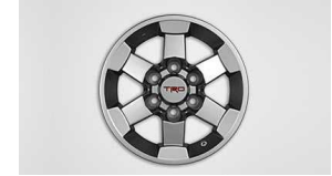
16-in. TRD 6-Spoke Alloy Wheels & LT265/75R16 BFG All-Terrain T/A KO Tires w/Wheel and Spare Tire Locks $1,899 Installed MSRP*